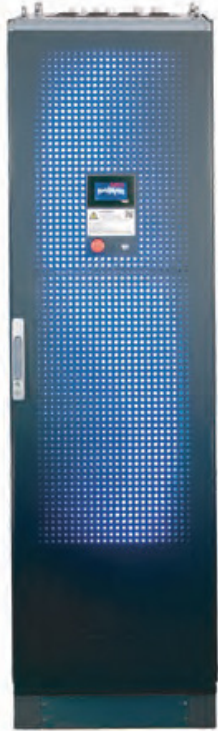
Light Weight, Long Life, Low Total Cost of Ownership

The Saft Flex'ion lithium ion battery solution, BCL05, is purposefully designed for mission critical applications. Utilizing Lithium Iron Phosphate (LFP) technology, the BCL05 solution provides a 20 year life span, far superior to lead acid batteries, and is built for short 5 minute EOL (End of Life) solutions. BCL05 is easy to install and requires no additional control power. Once installed, the connectivity to your building management system is simple to complete with standard Modbus TCP/IP communication and Integrated HMI display. BCL05 is capable of being remotely monitored using a secure smart device to make operational checks a breeze.