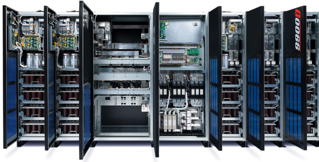
The 9900D is designed for ease of maintenance and reliability