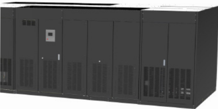
Custom Engineered and Modular Solutions Available