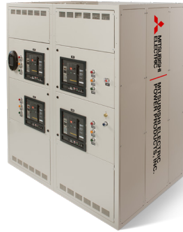
Optional Maintenance Bypass Cabinet